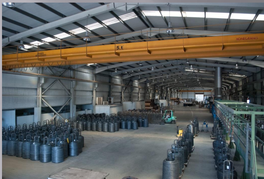
Our production line can bear 5,000 tons per month