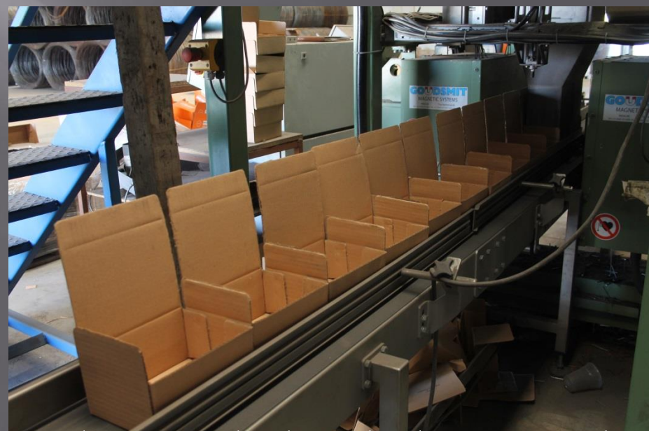
Nails are packed in 5kg boxes or 25kg bags