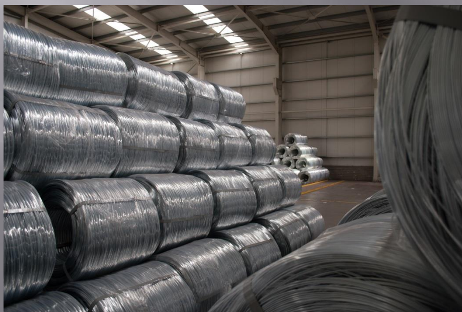
Wire is packed in coils of 500 – 800kgs